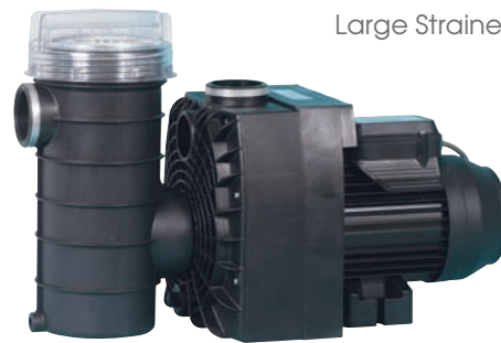
Large Strainer Model (LS)