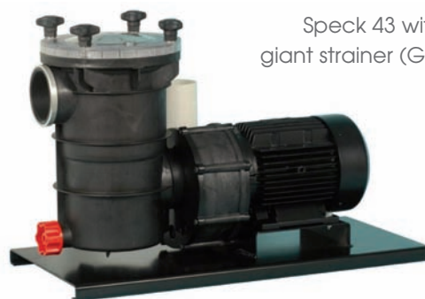
Speck 43 with giant strainer (GS)